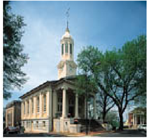
Fauquier County Courthouse in Old Town Warrenton

- newsletter of the Warrenton Stamp and Coin Club