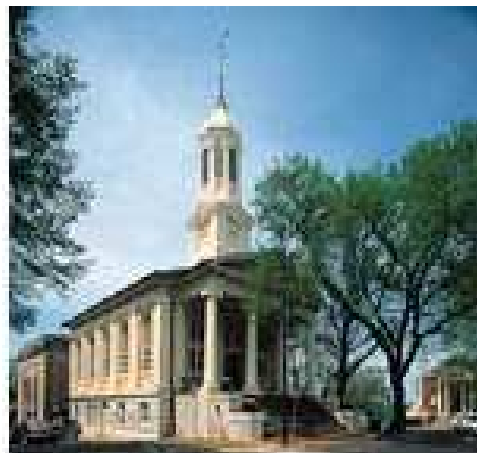
Fauquier County Courthouse in Old Town Warrenton

- newsletter of the Warrenton Stamp and Coin Club